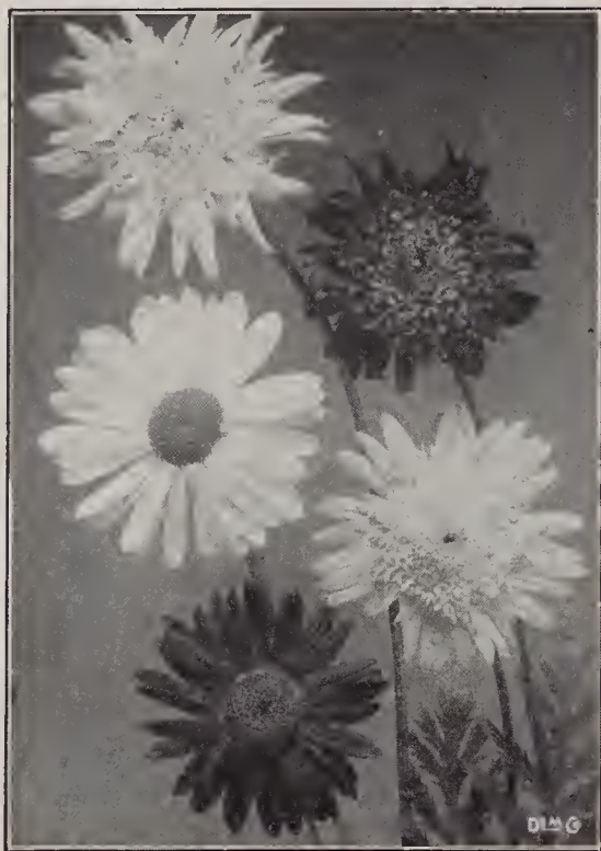
PYRETHRUM (see page 35)